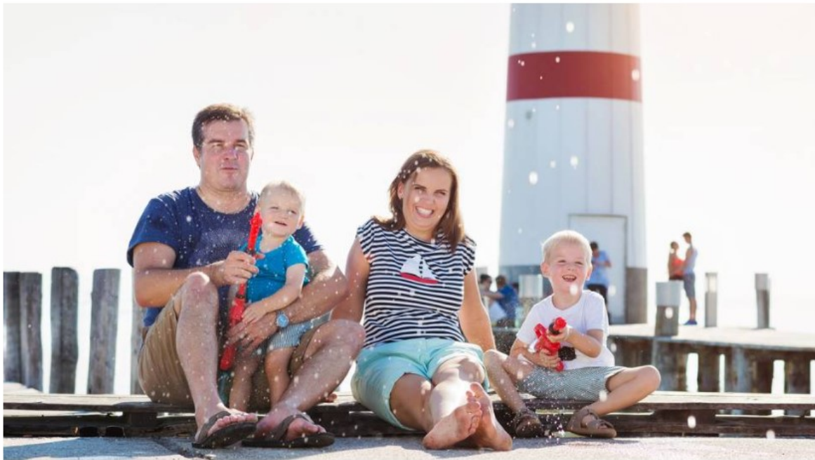
'Lighthouse parenting' gives children more freedom but with supervision if they need it.

Balance has always been a key component of parenting, both for the child and caregiver. According to a study by the Journal of Research on Adolescence, the key to parenting success is finding that balance. The study suggests that parents who are “accepting with clear boundaries; encouraging autonomy with practical limits; displaying warmth with reasonable discipline” see the best outcomes in adolescents. As we look ahead to the coming year, balance is a recurring theme in parenting trends in 2025.