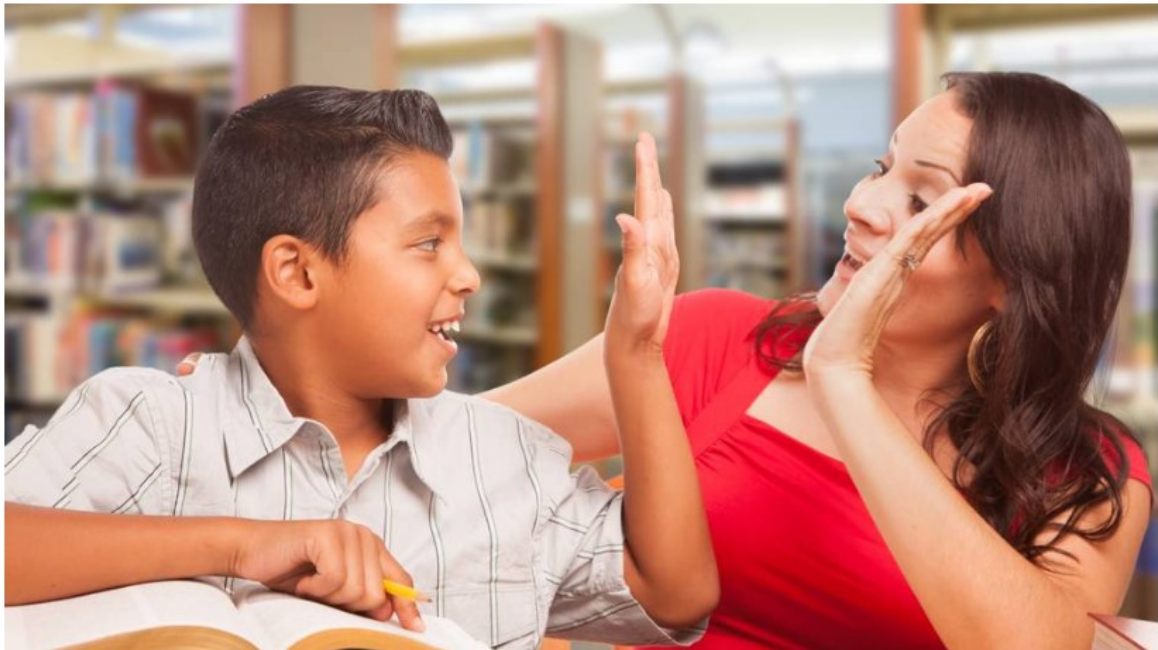
Miami-Dade County students can get free tutoring online and in-person thanks to the Homework Help & Tutoring Program sponsored by The Children’s Trust and Miami-Dade County Public Library System.

From pressure from grades and exams to stress and difficulty, there are many reasons why a child may need academic support beyond the classroom. Parents and caretakers who haven’t had to solve algebraic equations since grade school or have to work more hours to cover household costs, also face additional strain, leaving less time to help children study at home.